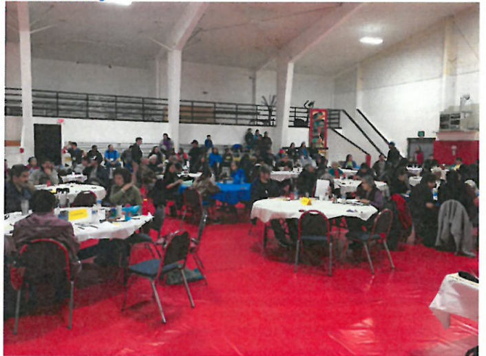
Attendees at the 12 th annual meeting