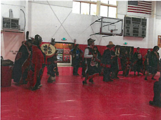
Keex Kwaan Dance Group performing at IPEC's 12 th annual meeting